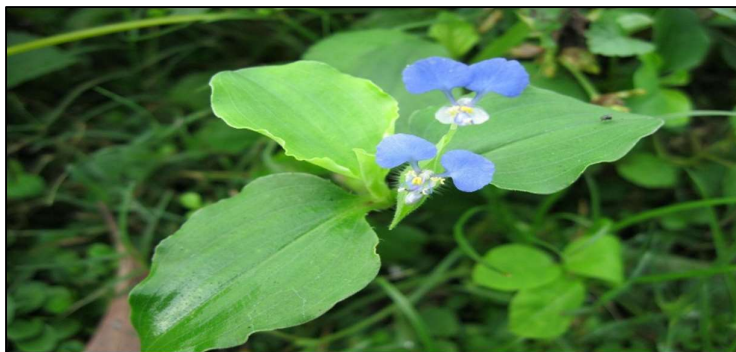
Fig 1: Commelina benghalensis Linn

medicine, mental healer's medicine, herbal medicine, and various other forms of indigenous medicinal practices(2).