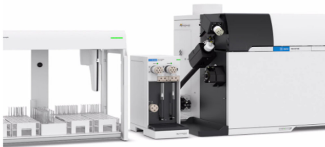
Fig 1: Agilent ADS 2 auto dilutor with 7850 ICP-MS

With the intelligent auto-dilution feature of the Advanced Dilution System (ADS 2), the Agilent ICP-MS instrument is enhanced. The ADS 2 replaces the need for manual dilutions with its range of intelligent tools integrated into the ICP-MS Mass Hunter, including auto-calibration, predictive dilution, reactive dilution, and other features. Errors in standard preparation are eliminated as a fully integrated, single-supplier automated solution that is made to interface easily with Agilent auto samplers, ICP-OES, and ICP-MS instruments and software. and resources such as time can be conserved with auto-calibration from a standard stock library 3 . The operator need not even calculate dilution factors attributable to the calibration utility. Reactive and prescriptive dilutions can be mixed together as needed in a single run to enhance the universality of every sample batch. In order to give the analyst a quick overview of the best-combined data, advanced data analysis combines several dilutions into a summary report. The Advanced Dilution System, or ADS 2, is a revolutionary automation workflow solution that will boost output, reduce ownership costs, and enhance overall laboratory efficiency. Agilent Technologies Inc. announced its debut.